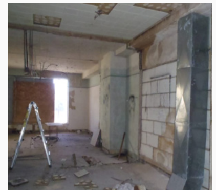
INTERIOR PHOTO OF WAHKONSA ANNEX WHERE ASBESTOS CONTAINING MATERIALS WERE DISCOVERED DURING INSPECTION.