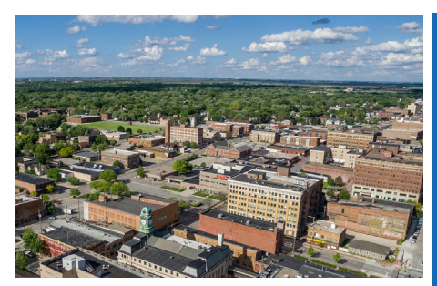
Downtown Fort Dodge, Iowa

The Environmental Protection Agency (EPA) facilitates states, communities, and other stakeholders to work together to prevent, assess, safely clean up, and sustainably reuse brownfields. A brownfield site is real property, the expansion, redevelopment, or reuse of which may be complicated by the presence or potential presence of a hazardous substance, pollutant, or contaminant.