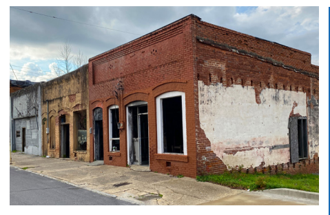
Vacant brownfield properties