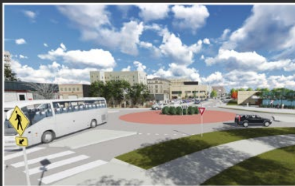
2ND AVENUE REALIGNMENT

Some of the funds will be used to conduct environmental site assessments to facilitate the realignment of 2nd Avenue South into 1st Avenue South, now known as the Cross-Town Connector Project.